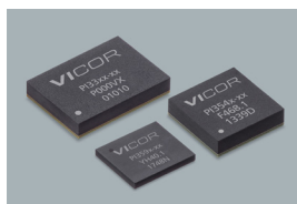
ZVS buck regulators

Inputs: 12V (8 – 18V), 24V (8 – 36V), 48V (30 – 60V) Output: 1 – 16V Current: Up to 22A Peak efficiency: Up to 98% As small as 7 x 8 x 0.85mm