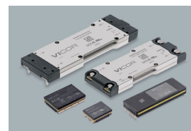
BCM bus converters

Inputs: 36 – 60V 38 – 55V 200 – 330V 200 – 400V 240 – 330V 260 – 410V 330 – 365V 360 – 400V 400 – 700V 500 – 800V Output: 2.4 – 55V Current: Up to 150A Peak efficiency: Up to 98% As small as 22.0 x 16.5 x 6.7mm